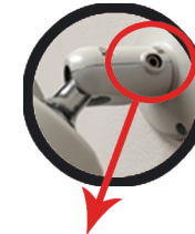
One-Screw Ball & Socket Mount